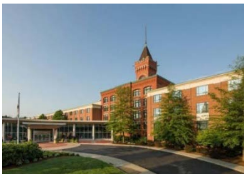
The Wellsworth Hotel

You can play for gold in our next regional tournament to be held April 17-21 at the Wellsworth Hotel, Southbridge, MA.